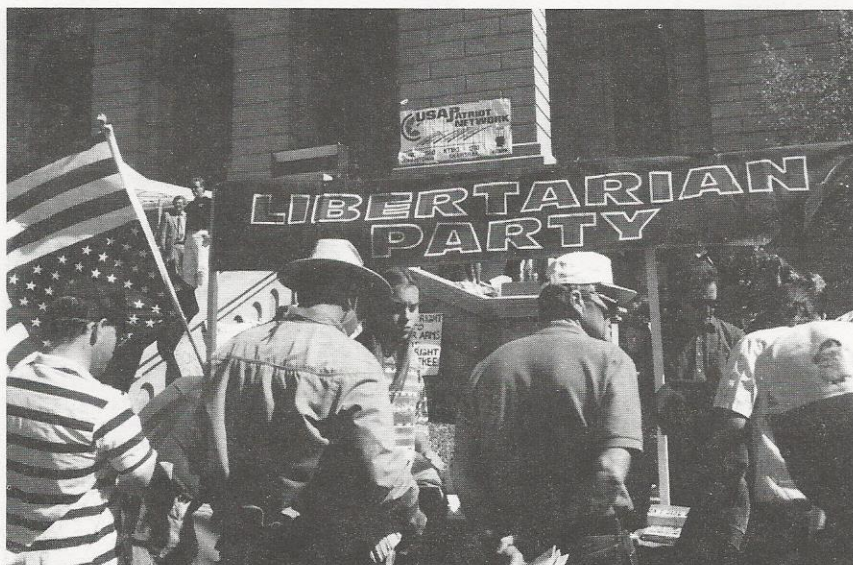
At past Right to Bear Arms rallies, the Libertarian Party table has attracted large crowds.